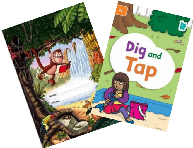
Reading Record and Reading Book